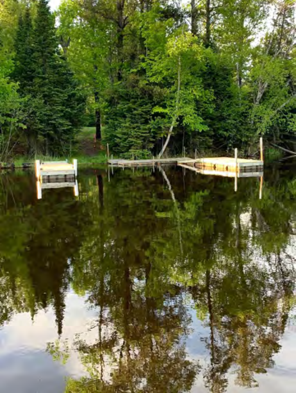
The Dock on the Left