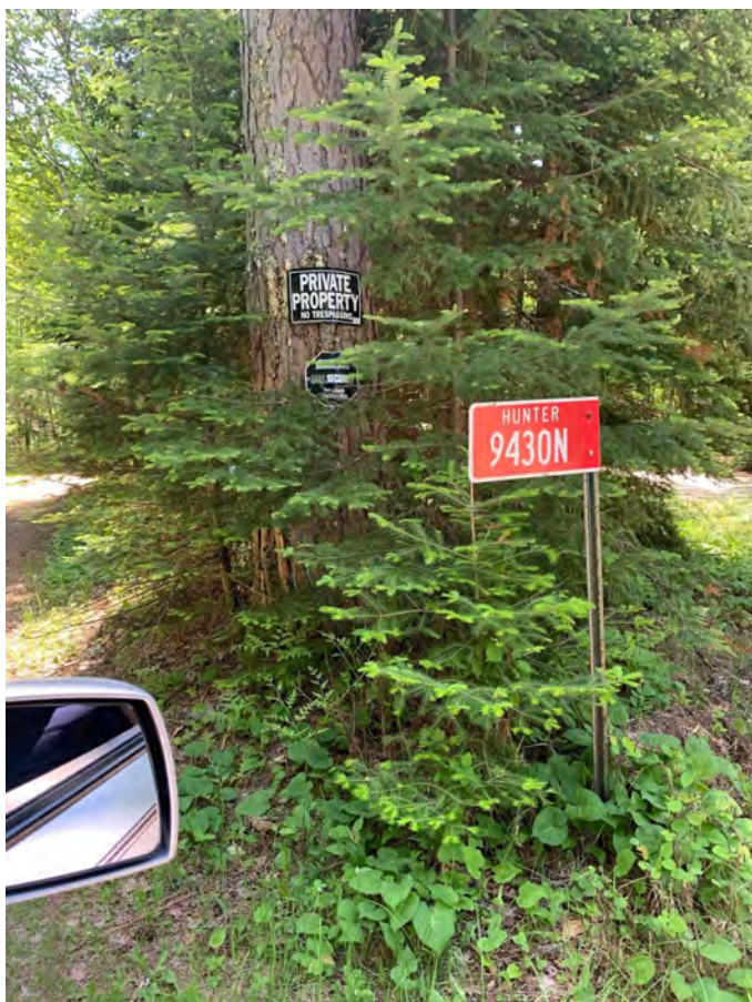
This is the number of the private driveway