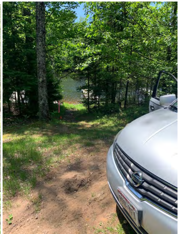
This is the path down to the dock