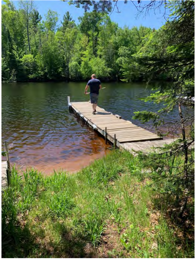
Here is the dock and park your boat on the side with the red reflector on it Please.